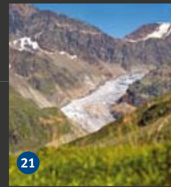
Panoramic view 1 2,220 m

Here you'll find some spectacular scenery as well as a climbing garden for both experienced climbers and beginners. 26 routes stretch across an area approx. 150 metres wide and approx.100 metres high. They range from difficulty