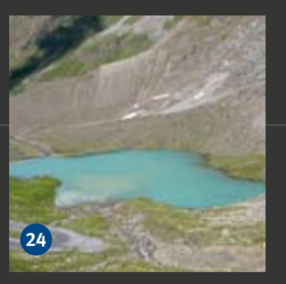
Lake Weißsee 2,425 m

The Gepatschferner is the second biggest glacier in the Eastern Alps. It covers an area of approx. 18 km². Glacial run-off at about 2,080 metres above sea level forms the Gepatschbach stream, which flows into the Gepatsch reservoir.